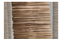
1.14 million brown paper supermarket bags used in the USA every hour