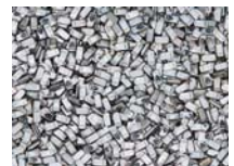
426,000 cell phones retired in the USA every day