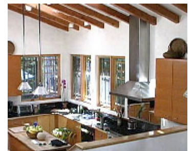
Bau-Designed Living Spaces