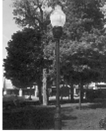
Example of unshielded light fixture