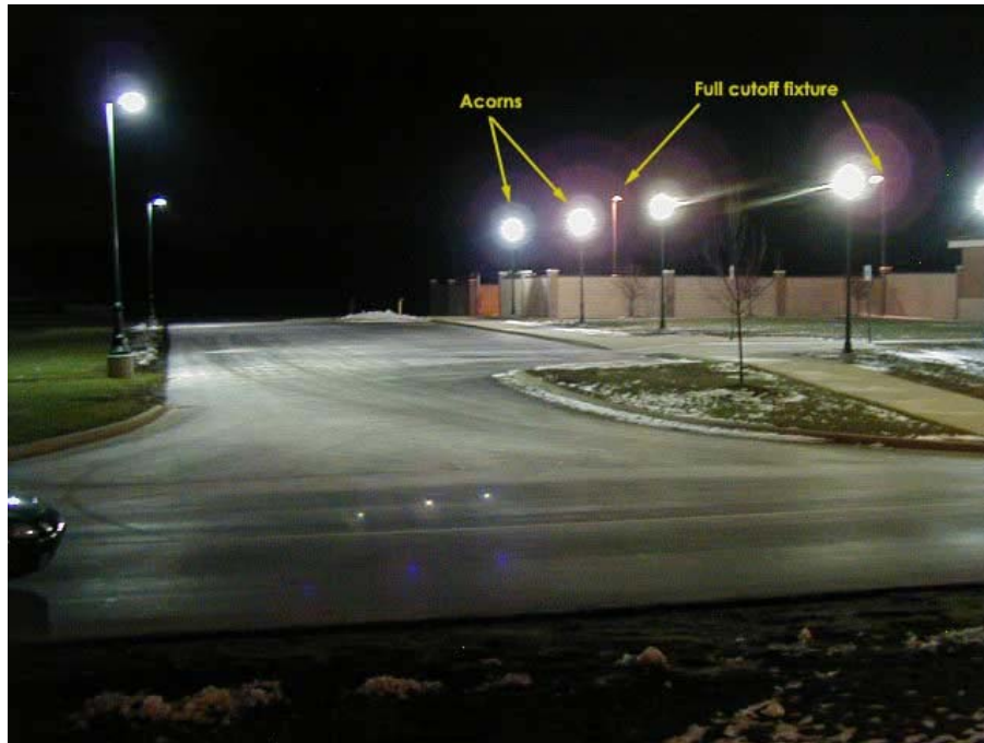
A comparison between unshielded acorn lights and full-cutoff lights.