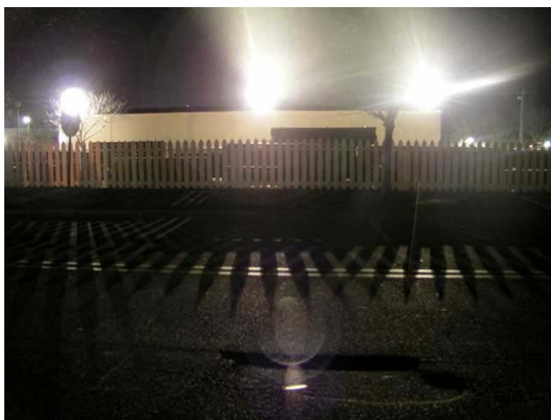
Intense glare from rooftop-mounted floodlights shines out from this lumberyard. Can you read the sign?