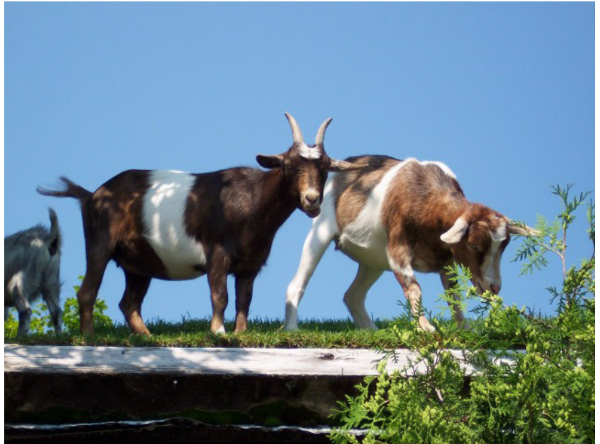
Green rooftops can serve a variety of functions, from insulation to water catchment to harvesting the sun's energy. Some, like this one, even accommodate grazing goats!

commissioning for more than 30 industrial and commercial buildings, including the new 10-floor, $437-million Los Angeles Police Administration Building.