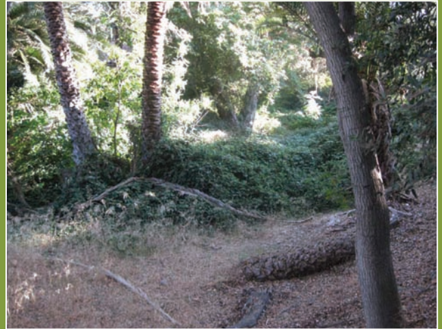
Before: Ojai Creek was overrun with non-native plants such as vinca, Cape ivy and Himalayan blackberry. Additionally, Canary Island date palms were choking out the creek bed and spreading seeds downstream.