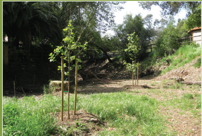
After: Non-natives have been removed and native riparian species such as willow, mulefat and California sycamore have been planted. The stream is flowing and more surface water is available with the eradication of invasive plants and trees.